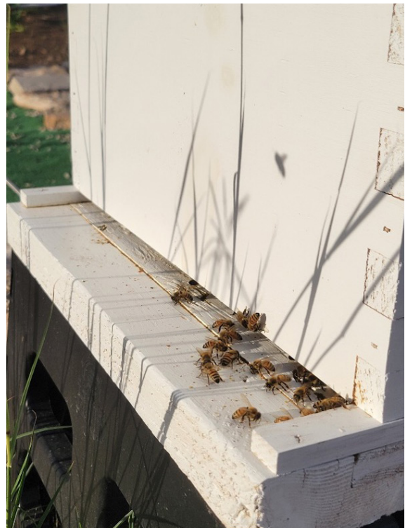
Guard bees at entry of hive.