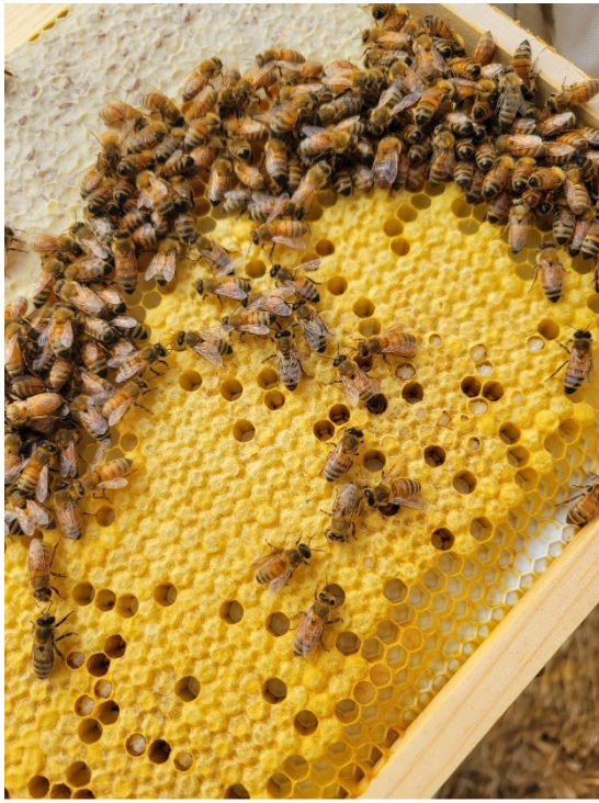
Frame of worker brood with capped honey at top of frame.

VSH). Once a worker detects this infection in a cell, they chew a small hole to allow the brood to die (and the mites with it) or they will remove the developing brood as well as the mites that were feeding and multiplying in the cell. This behavior is extremely helpful in controlling the level of Varroa mite within the colony and protecting from the viruses they vector.