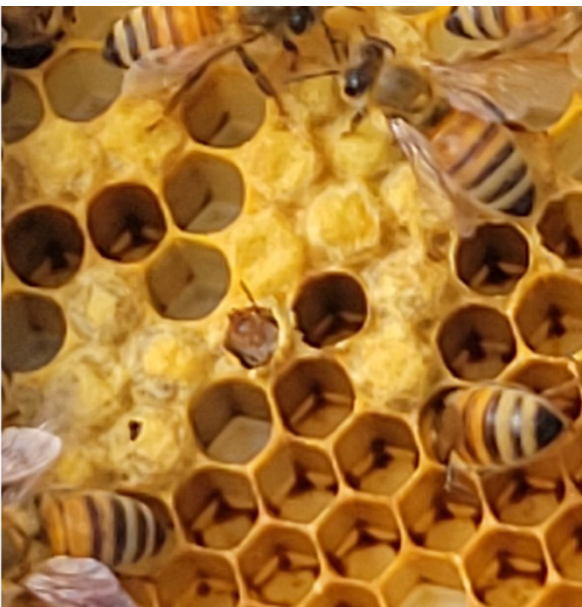
New bee emerging from cell

Cleaning of Cells involves removal of the debris from the last cocoon and the fecal matter deposited by the developing larvae. Bees are able to remove most but not all of this debris so the cell size gradually gets smaller with every use. The wax also darkens with every use from the accumulated debris remnants. Other surfaces within the hive that are hard to clean may be covered in fresh wax or propolis, or a combination of wax and propolis. Propolis is a sticky resin that is collected from trees and shrubs and which has antifungal and antibacterial properties. The capping over brood is covered with a wax/propolis mixture, while honey is capped with just wax. This makes the brood areas darker in color and the capped honey lighter in color. These cleaning bees are very important to the survival of the colony. They are also the ones responsible for detecting the pheromone produced by the larvae that are currently infected with Varroa mites (Varroa Sensitive Hygiene or