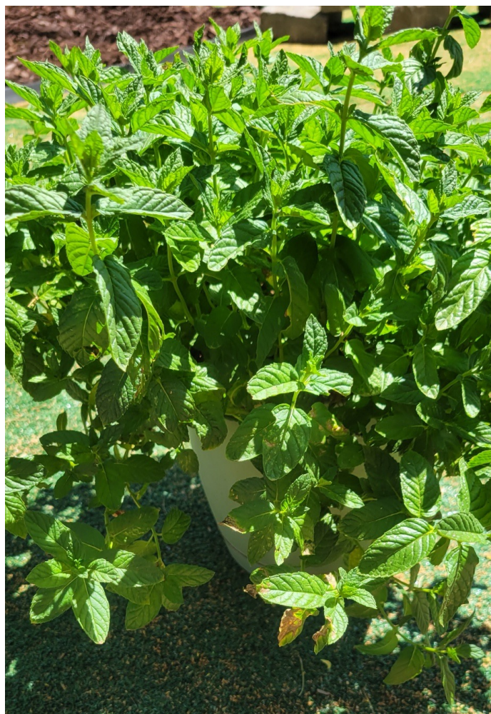
Mint should be grown in a pot with a saucer underneath so they don't spread.

For plants in the ground, it is better to water deeply and less often. Daily, shallow irrigation can stunt and kill plants in the ground. The garden can be watered manually by hose, drip irrigation, or soaker hose making sure the water soaks in at least 12 inches. As a rule, water should not be applied to the foliage because it can cause sunburn and the minerals in our water can cause leaf damage. If using drip irrigation, make sure emitters are strategically placed especially for herbs that increase by creeping along the soil surface such as thyme, prostrate rosemary, and catnip.