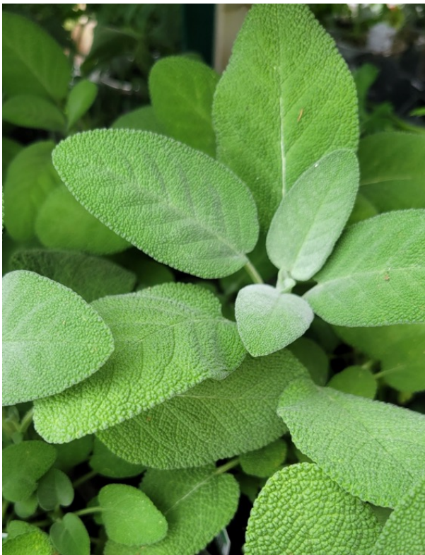
Fuzzy sage leaves

To reduce herbs to powder, put in blender. Store jars, plastic bags, or tins in a dark cupboard. Store up to a year then replace. In cooking, use 1/3 to 1/2 more fresh herbs than when using dry herbs. ( Herman, 2021 )