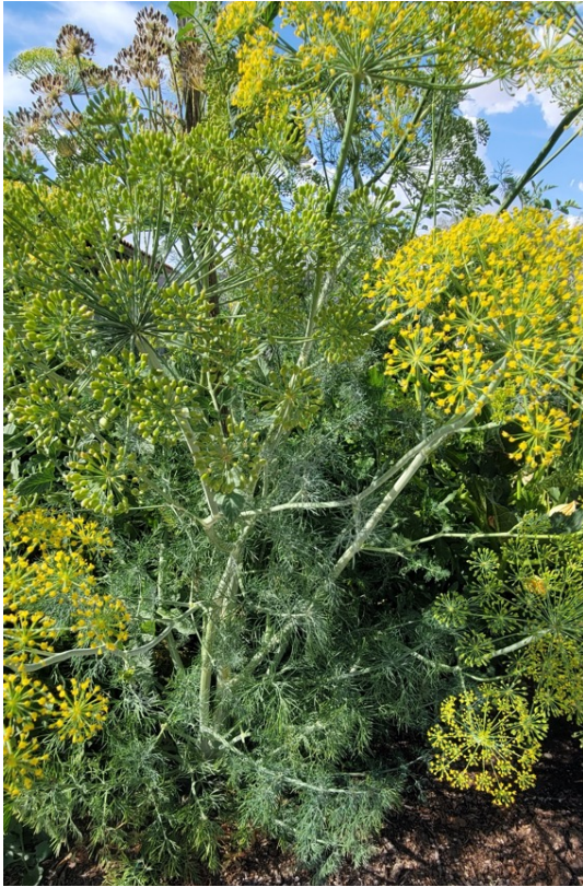
Dill in bloom