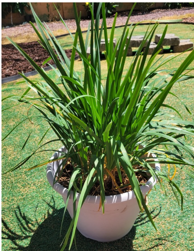
Garlic chives grow great in a pot

All containers must be thoroughly clean when planted and should be soaked for a short time in a 10% bleach solution to sterilize them and kill any harmful organisms if they were used previously.