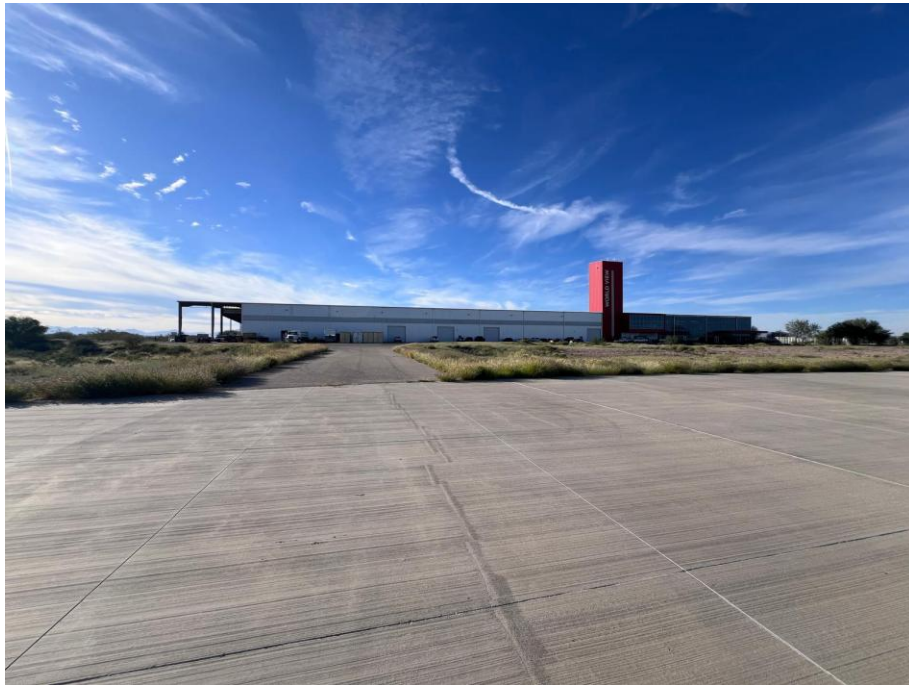
Looking back to the Worldview facility.