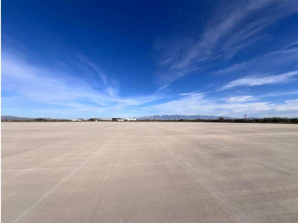
Launch pad looking north. Entire pad is about 700ft in diameter.