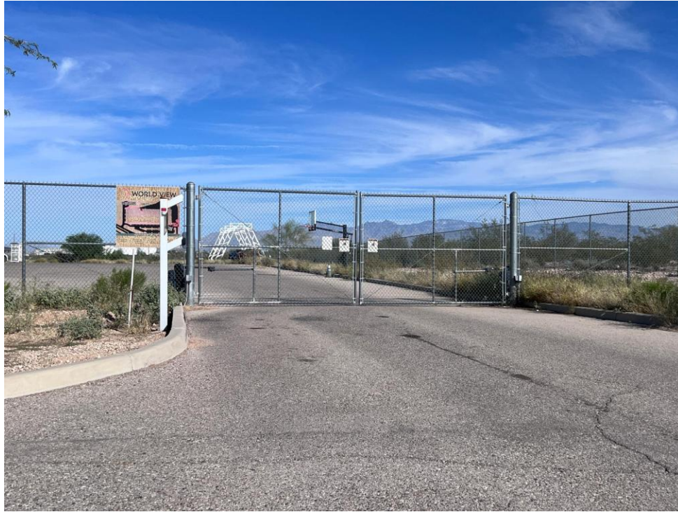
South gate entrance.