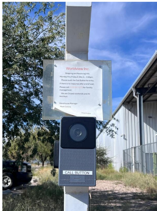
South gate call system. Reads, "Push call button for entry, if there is no response after a brief wait, please call 530-241-5773 for facility management"