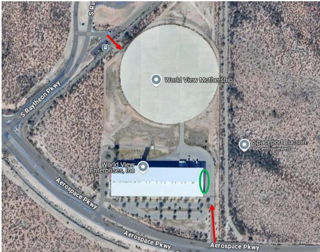
Tucson Spaceport located 32°05'11.5"N 110°56'40.6"W. Northwest and South entrances shown with red arrows. External building bathrooms circled in green.