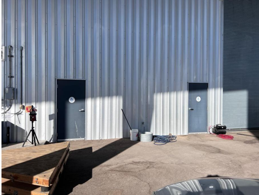
Two external bathrooms.