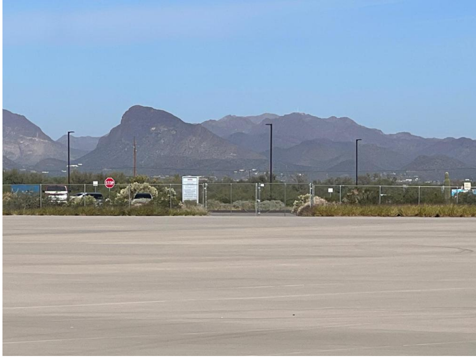
Northwest entrance gate (not typically used).