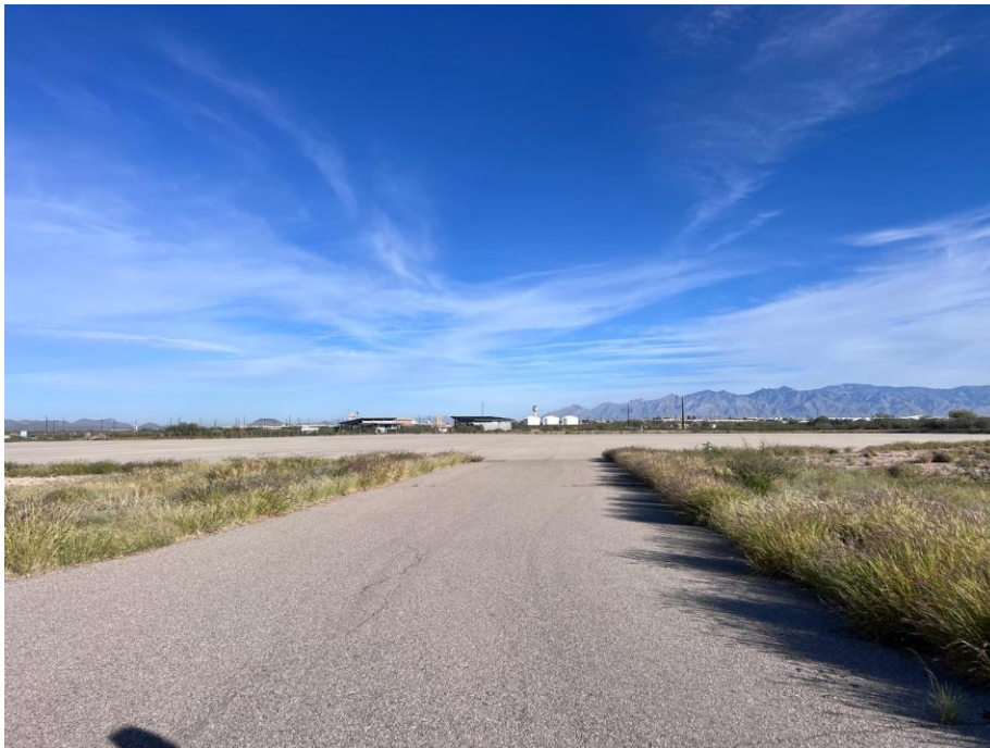
Road out to launch pad looking north.